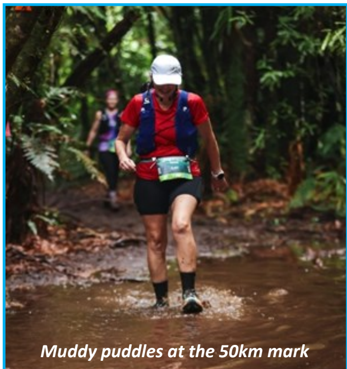
Muddy puddles at the 50km mark

It was an incredible course; beautiful scenery & the volunteers were next level. Anything they could do to help they did; every runner was cared for in a way I have never seen before. I was very pleased to see hubby at the 57km check point &